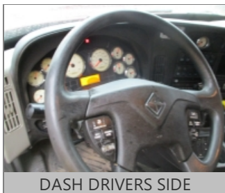
DASH DRIVERS SIDE