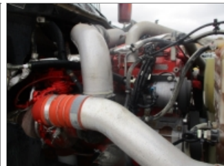
RIGHT SIDE ENGINE