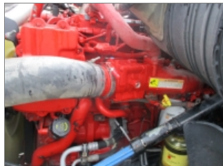
LEFT SIDE ENGINE