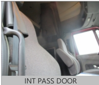
INT PASS DOOR