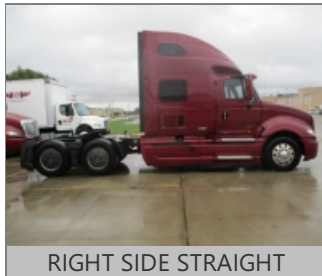
RIGHT SIDE STRAIGHT