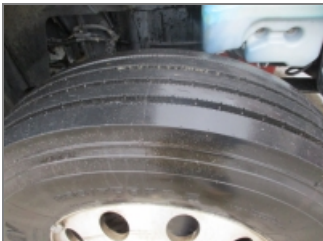
RIGHT SIDE STEER