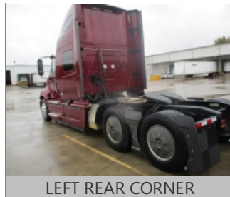
LEFT REAR CORNER