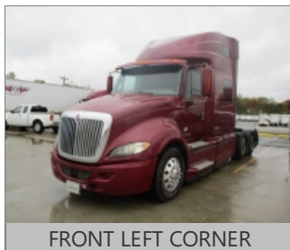
FRONT LEFT CORNER