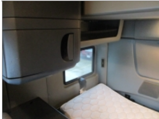
RIGHT SIDE SLEEP AREA