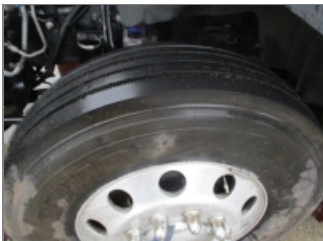
LEFT SIDE STEER