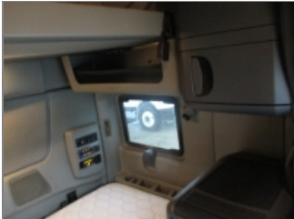
LEFT SIDE SLEEP AREA

INSP DATE UNIT NUMBER VIN (LAST 8) PO NUMBER 10/30/2019 378 FN699995 9750108005