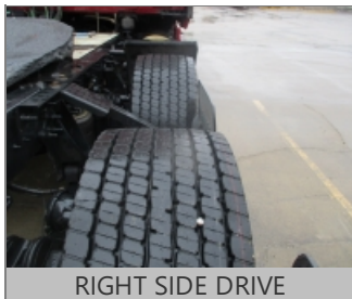
RIGHT SIDE DRIVE