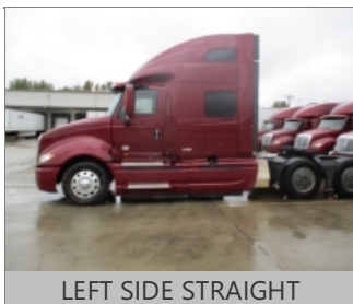
LEFT SIDE STRAIGHT